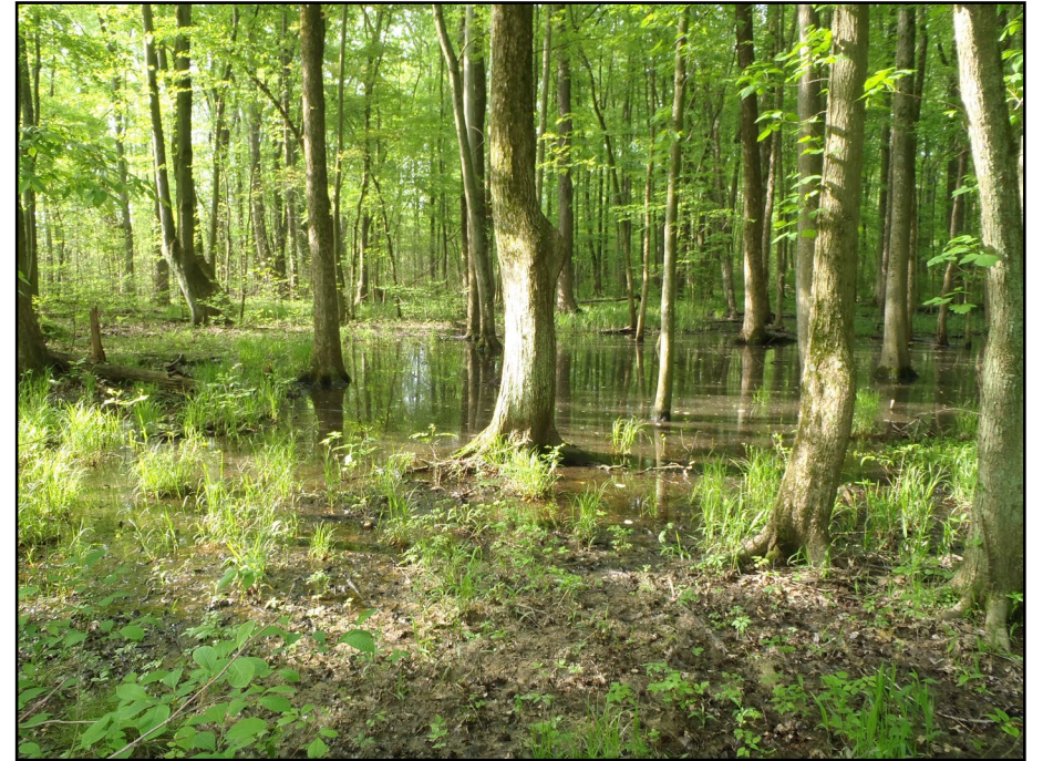
Wetland image